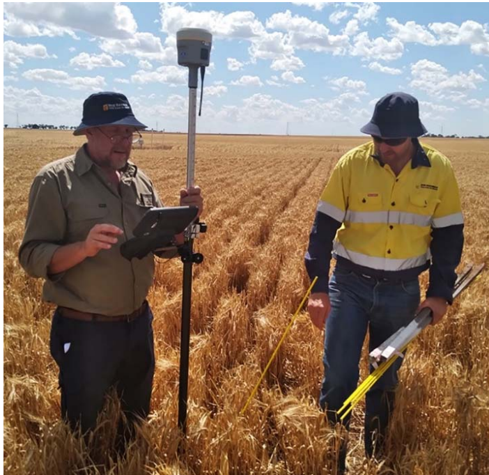
Avonbank test pit – inspection prior to harvest (November 2021)