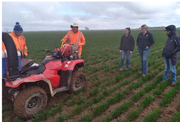
Students visit the rehabilitated site to inspect crop growth