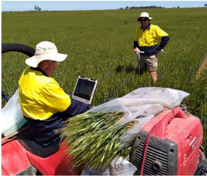
Avonbank test pit – crop inspection (October 2021)